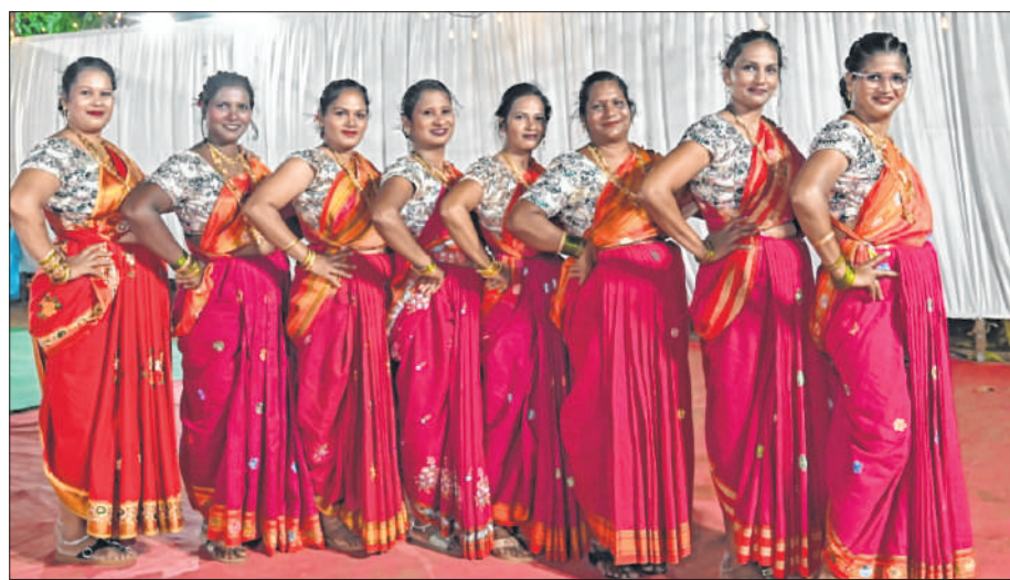
Mumbai's East Indian community organised its annual festival, East Indian Sola 2024, at Manori, near Malad, on Saturday. Helmed by the Moba! Gaonhan Panchayat, the community's main representative, the event celebrated the community's food, music, and dance. The East Indians are one of the original inhabitants of the islands that later became Mumbai. The event had free horse-cart rides, a feature of Manori.